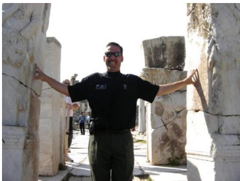
between, divided by