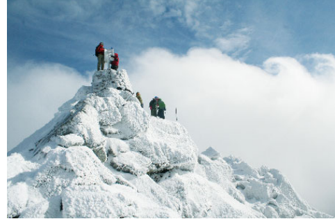
on top of