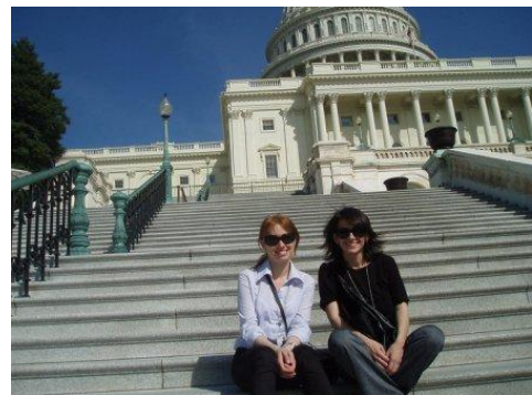
in front of